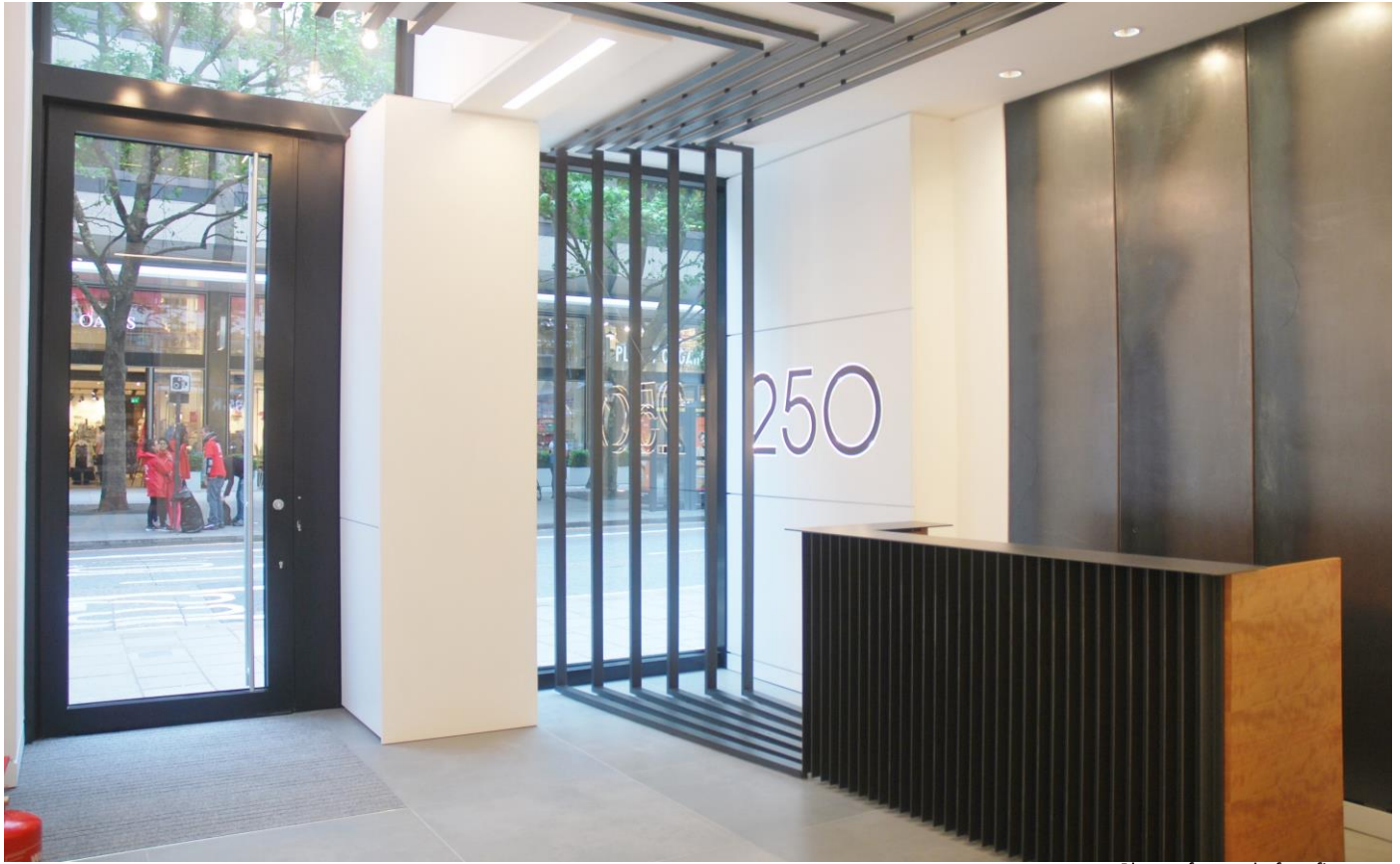
Photo of space before fit out